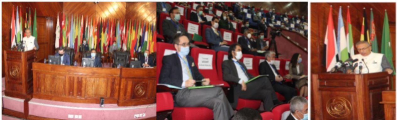
President of Pakistan, Dr. Arif Alvi inaugurated the Global Al-Farabi Forum at COMSTECH.

In his inaugural speech, the President urged the young generation of scientists and philosophers to follow the scholars like Al-Farabi to achieve excellence. The President